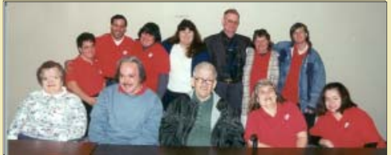
CAT Team Members

CAT members also planned a thank you dinner for the sponsors who donated $20 or more to help CAT members attend the statewide People First Conference that was in June in Sacramento. The thank you dinner was August 7 at Integrity House. The video that the team presented at the conference was shown at the dinner.